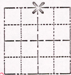
LOCATION (Indicated by 'X')