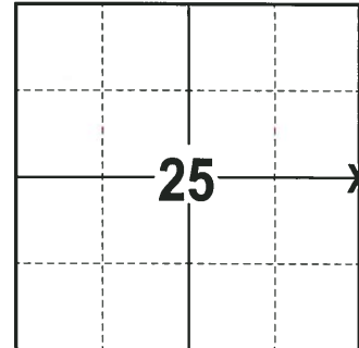
LOCATION (INDICATE CORNER BY "X")